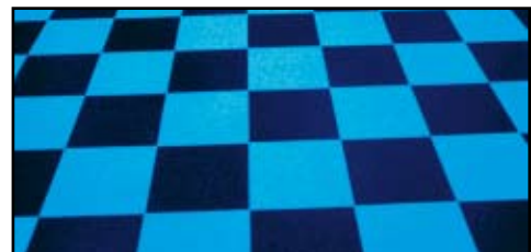
Standard checkerboard glow pattern

(612-530-500) GLOWSPASH Checkerboard Pattern Kit: 90 tiles (45 glow/45 non-glow) plus acrylic emulsion glue