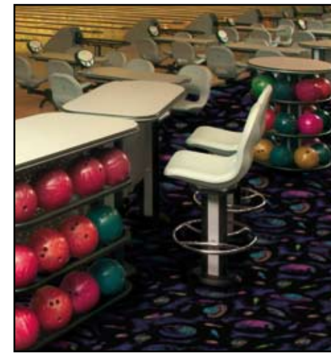
Dazzling GlowSplash carpet resists wear and tear with industrial strength.

This 34-ounce weight, 100% Nylon, high-traffic carpet is made with a process that actually fuses the neon dyes to the nylon fibers for greater glow properties. Two stain protectors protect against fiber-color change and spills seeping in.