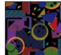
253-003-006 GLOWSPASH Contempo