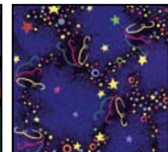
253-003-008 GLOWSPASH Pinz